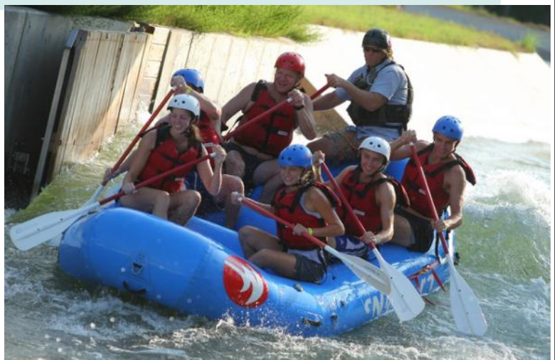
Even whitewater adventures are nearby

The local arrangements committee is working diligently to make sure your SGS experience in Charlotte is memorable and positive. We will host dine-arounds in many of the eclectic neighborhoods and the faculty, students, and alumni from UNC Charlotte’s Gerontology Program will be happy to help you get acquainted with the area. Please join us at the opening reception the evening of April 4 th to meet us and get acquainted with all that Charlotte, North Carolina has to offer.