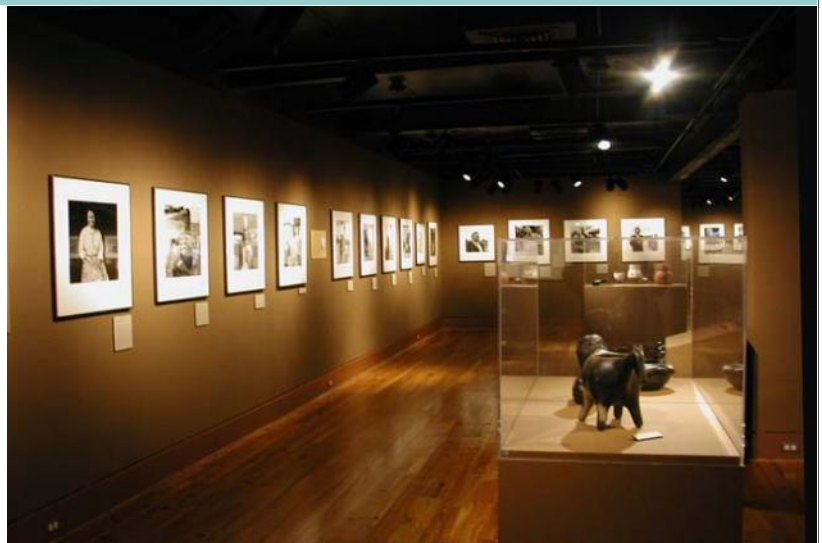
Levine Museum of the New South

uptown is your “source for all of the best performing arts events in Charlotte.” Just down the road is the U.S. National White-water Center which offers mountain-biking, running trails, a climbing center, kayaking, canoeing and rafting. The Levine Museum of the New South houses “the nation’s most comprehensive interpretation of post-Civil War Southern history.” Concord Mills Mall is one of the region’s largest outlet malls and is right down the road from Charlotte Motor Speedway – home to NASCAR.