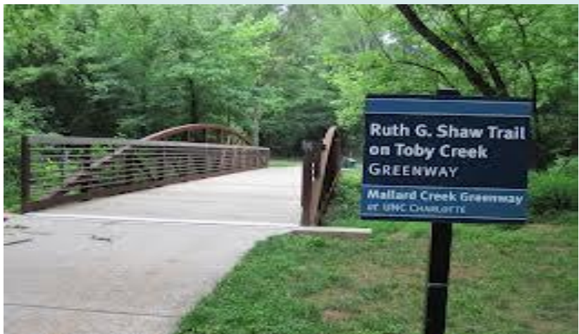
Several linking greenways offer a place to relax or exercise between sessions

Closer to the venue are the Mallard Creek, Clark’s Creek, and Toby Creek Greenways. These greenways are part of the Carolina Thread Trail system and combine for nine continuous miles of strolling, biking, and running pleasure. Part of the greenway meanders through the UNC Charlotte campus where you can take a detour and explore the public Botanical Gardens on campus or see the brand new UNC Charlotte 49ers football stadium.