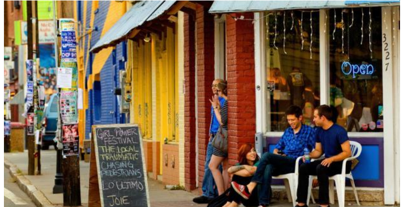
Bohemian North Davidson

Charlotte is full of opportunities for food and fun in addition to the conference activities. The greater Charlotte area is home to multiple eclectic neighborhoods each with something unique to offer visitors. Dilworth is Charlotte's first streetcar suburb and is on the National Register of Historic Places. Its bungalow style homes and oak tree-lined streets blend with a mix of shops