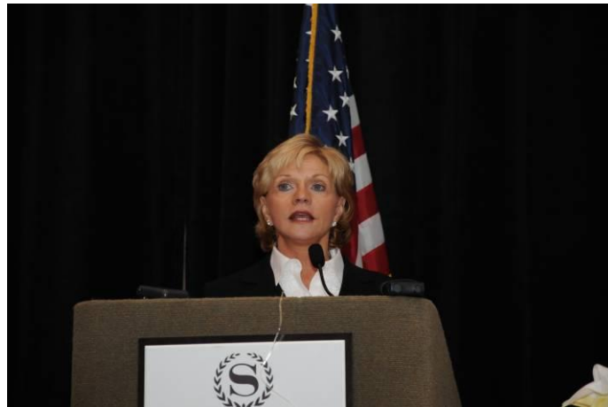
North Carolina Governor Beverly Perdue

Like every state and many nations, North Carolina faces new challenges and opportunities as our population ages. According to the 2008 American Community Survey, NC ranks 9 th in size of the population age 60 and over, 10 th in size of the population 85 and over and 6 th in grandparents responsible for raising grandchildren under age 18. Between 2010 and 2030 our population age 60+ will grow from 1.2 million to 2.1 million.