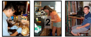
Undergraduate Research Experiences Summer

One idea to promote undergraduate research is to use an option in the traditional technical communication course, which many engineering curricula already require. This project assesses such an option in the College of Engineering at Virginia Tech.