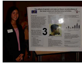
Documenting Research (2-credits) Fall