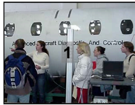
Preparing for Research (1-credit) Spring

Bucknell Georgia Tech (2 students) Penn State (2 students) Univ. of Karlsruhe Univ. of Virginia Virginia Tech (17 students)