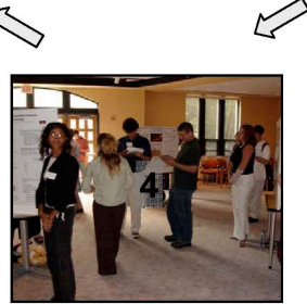
Undergraduate Research Symposium Fall